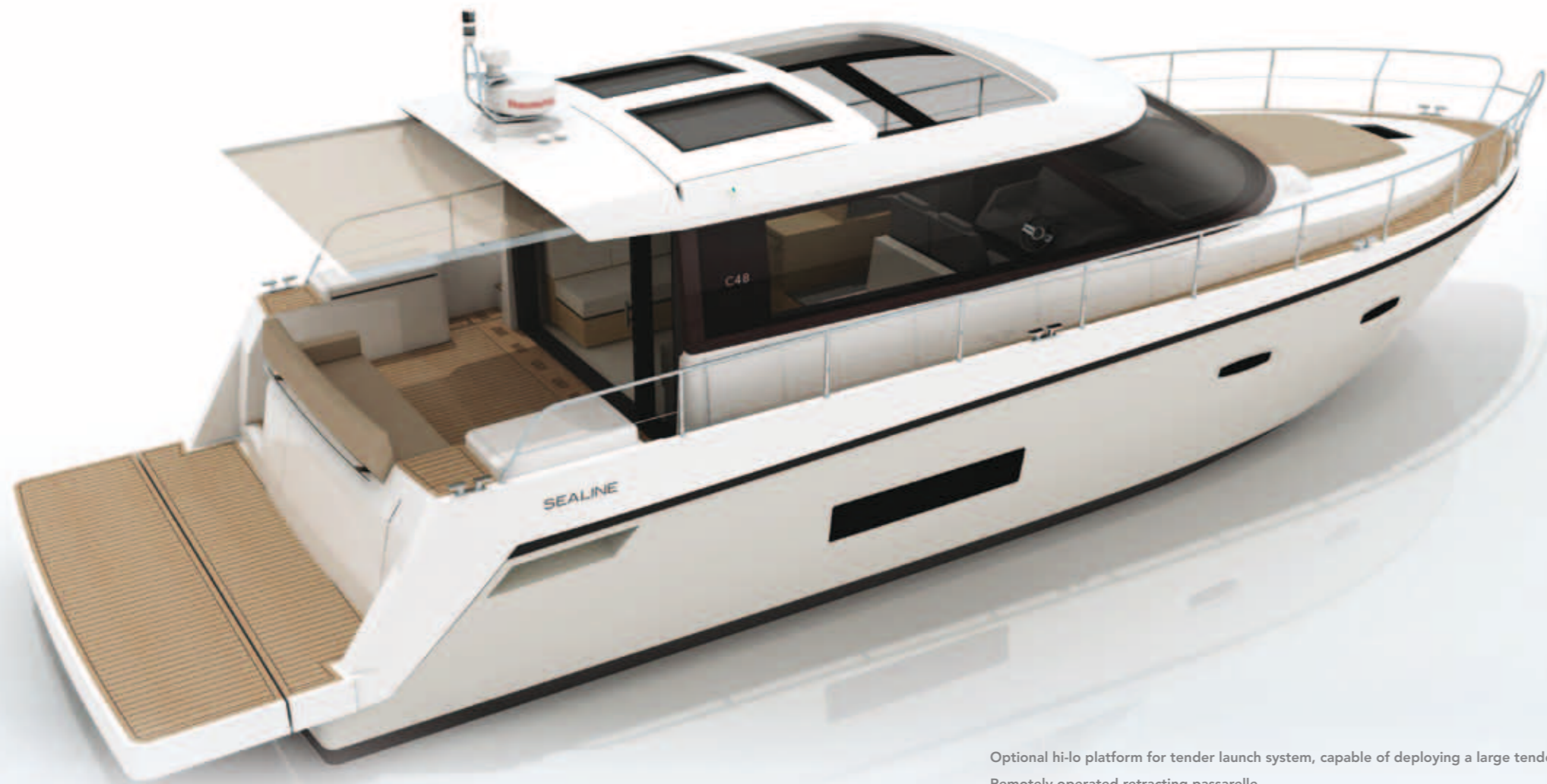
Optional hi-lo platform for tender launch system, capable of deploying a large tender Remotely operated retracting passarelle